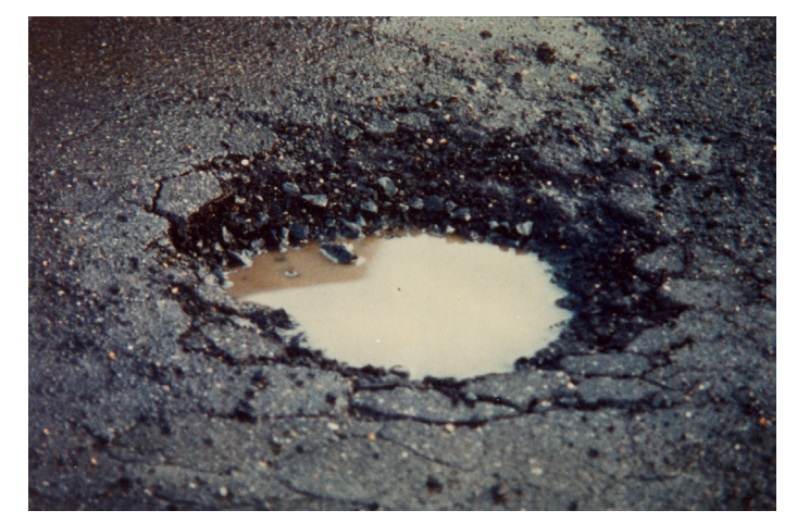
Deteriorated asphalt pavement

Moisture damage is a significant problem for flexible pavements. The damaging effect of moisture on pavements, specifically hot mix asphalt (HMA), is a significant environmental distress that should be considered. As a pavement is subjected to a freeze/thaw cycle, the material expands and contracts. During expansion, water can seep into permeable air voids created with the increased volume and can freeze. When the material contracts during thawing, the water can propagate the cracks created during freezing and cause further damage in the next freeze cycle, ultimately weakening the structural strength of the pavement layer. Over time, the repetition of the freeze/thaw cycle deteriorates the pavement and can lead to mix instability and road damage, such as ruts, if the moisture-susceptible mix is below the surface mix. Surface mixes that are susceptible to moisture damage can experience raveling. Identifying pavements susceptible to moisture damage and the effects of moisture damage on the life of pavement can reduce maintenance costs accrued with the placement of a poorly performing HMA.