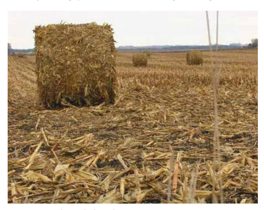
Cornstover used to make bio-oils

Different types of bio-oils derived from three bio-mass sources, oakwood, switchgrass, and cornstover, were examined. All three sources of oils were subjected to physical, chemical, and rheological testing.