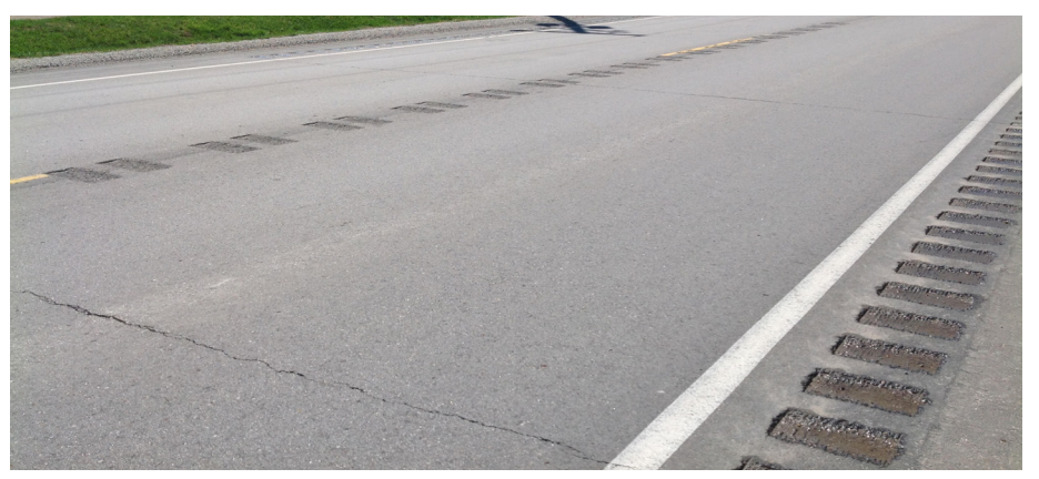
Reflective cracks in non-interlayer overlay on US 169 in April 2014

To assess how effective the interlayer is at delaying reflective cracks, the field performance of an HMA overlay using a one-inch interlayer was compared to a conventional HMA overlay without the interlayer.