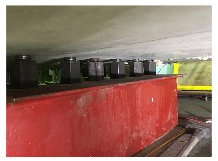
Restraints used to restrict deflection under one beam

Following full curing of the joint (when the joint concrete was two months old), a series of cyclic live loading tests were conducted on the specimen. Generally, the cyclic loading was applied at a frequency of 2 Hz and the beams were tested with two different boundary conditions: both beams simply supported and one beam restrained (to generate higher stresses in the joint).