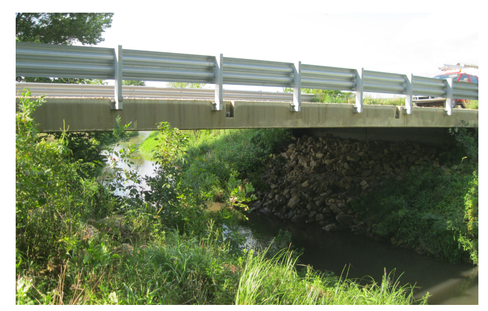
Box beam bridge in Buena Vista County, Iowa

Generally, the reflective cracks in-and-of themselves do not pose a safety hazard. However, these cracks provide a direct path for water (plus chlorides) to enter the structural system causing corrosion of the mild and prestressing steel. Ultimately, this situation can lead to significant maintenance costs and/or safety concerns. Because of this, some early users of adjacent box beams now only allow them on low-volume roads where salt application does not occur.