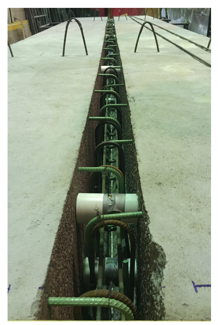
Two box beams placed side-by-side with roughened interface surfaces for the joint material and reinforcing steel couplers during construction of the innovative wide joint specimen in the laboratory

The research team constructed and tested a 30 ft long specimen consisting of two concrete box beams with the innovative joint between them in the laboratory. The researchers performed laboratory tests on the joint, replicating previous FHWA UHPC joint testing, including temperature loading and cyclic vertical loading. During the testing, strain, displacement, and temperature were collected using the following devices: vibrating wire strain gauges (VWSGs), displacement transducers, and thermocouples.