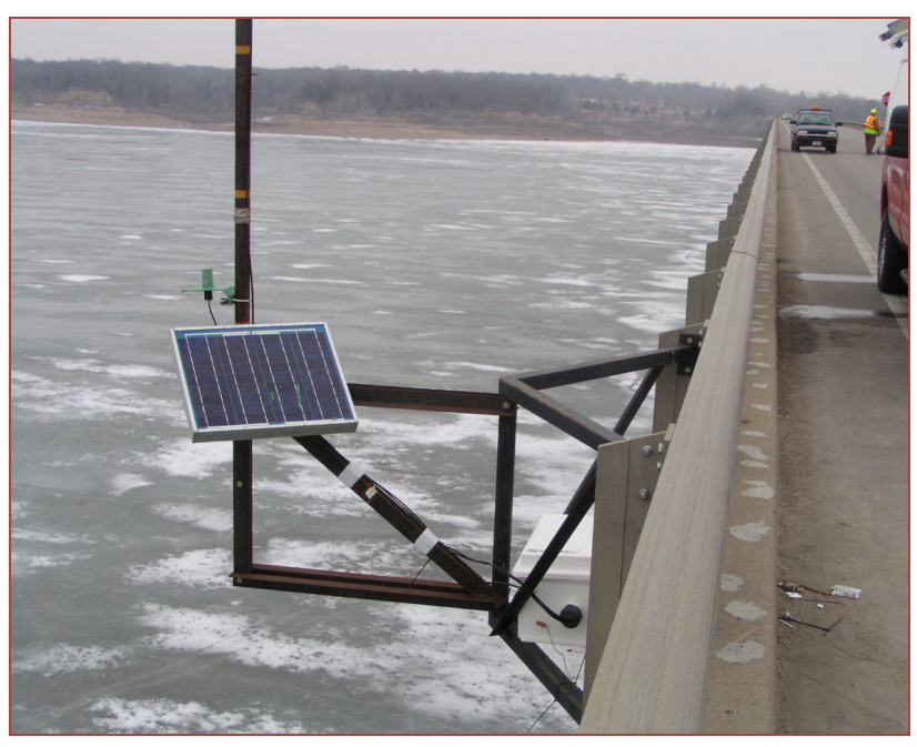
Cellular antenna and solar panel mounted on A-frame