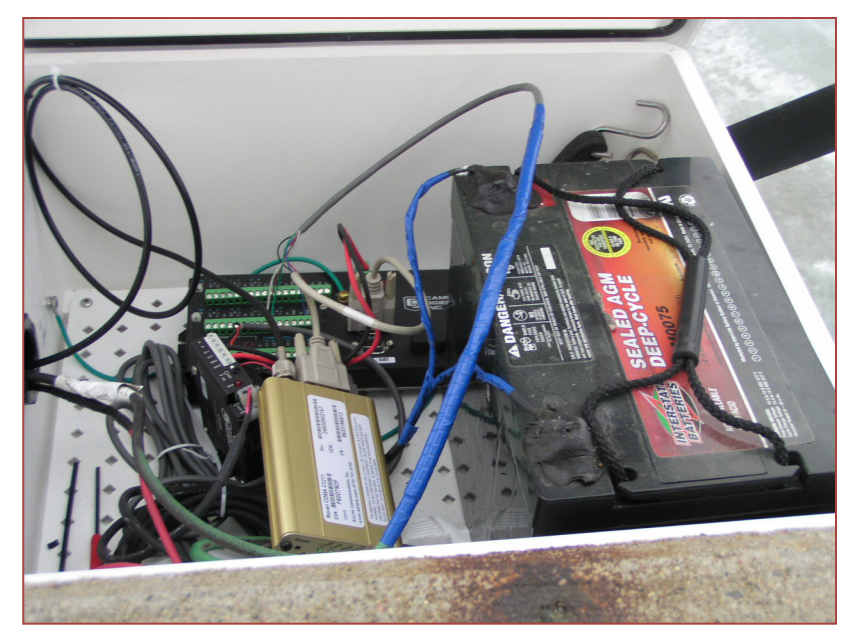
Monitoring equipment inside enclosure at the Saylorville Reservoir Bridge

Based on data collected over the one-year duration of the project, the wind data suggest that both locations (Saylorville and Red Rock) experience similar trends in wind direction, 3 minute average wind speed, and 3 minute maximum wind speed.