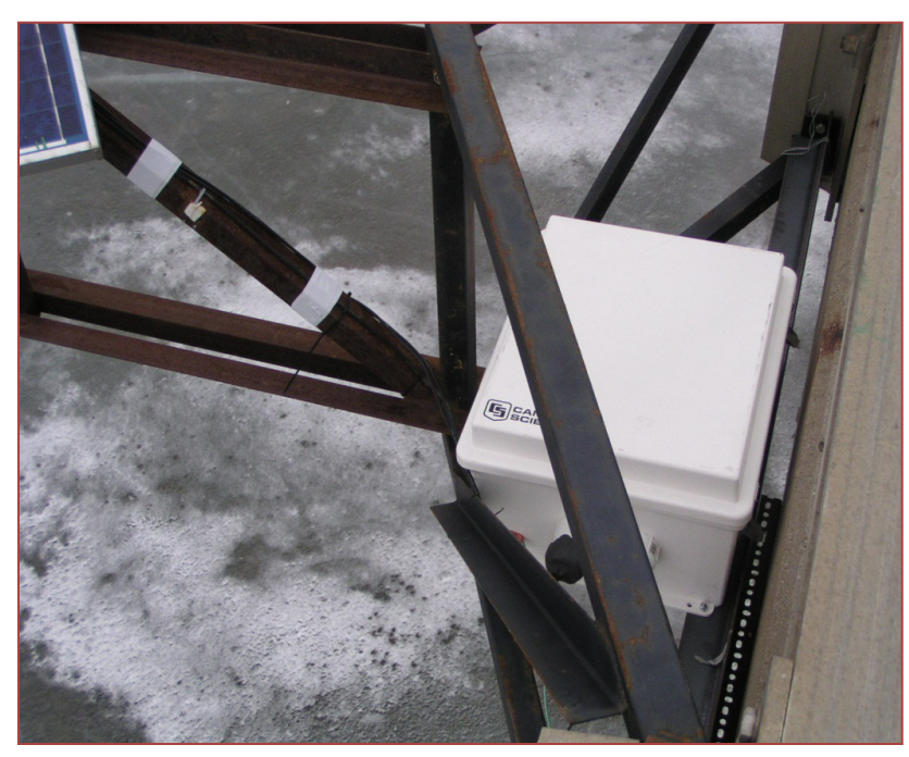
Datalogger enclosure mounted on A-frame

Once the system was functioning and providing the Iowa DOT with accurate, reliable alerts that allowed for the safe and timely closing of the structure during high wind events, there was a desire to provide the wind data information to Iowa DOT personnel as well as to the public.