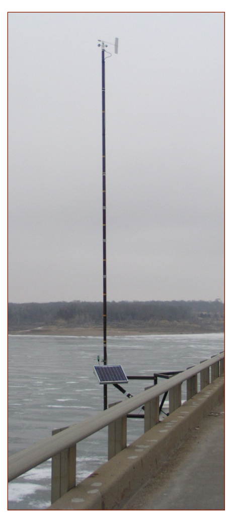
Anemometer mount at the Saylorville Reservoir Bridge

The original intent was that, once the text message is received, the bridge entrances would be closed until wind speeds diminish to safe levels.