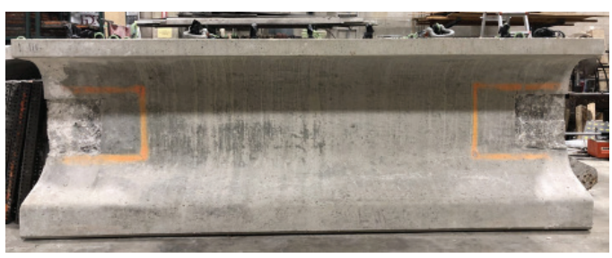
Beam specimen with artificial damage on both ends

Specimens for splitting tensile strength test (left) and slant shear strength test (right)