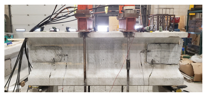
Patched beam specimen instrumented for the four-point bending test