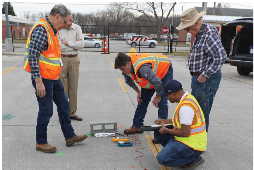
Electrical safety testing of an ECON pavement at the Iowa DOT facility

ECON heated transportation infrastructure systems offer a promising solution. These systems operate on the principle of ohmic heating, in which electricity is applied to the pavement slab through embedded electrodes to convert electrical energy into thermal energy. This process raises the surface temperature of the pavement, effectively preventing ice formation or melting existing snow.