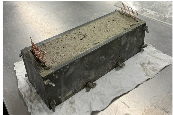
ECON beam at Iowa State University’s Portland Cement Concrete Laboratory

To establish electrical safety protocols for the ECON heated transportation infrastructure system, a series of electrical tests was conducted in collaboration with cdcmello Consulting LLC and a field evaluation group from Underwriters Laboratories (UL).