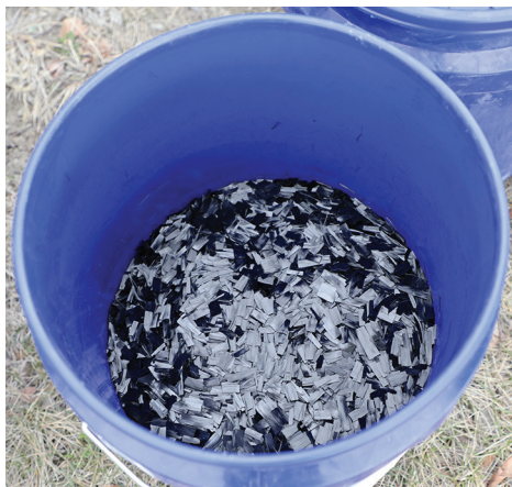
Chopped virgin carbon fiber

For each trial, at least three beams (14 in. x 4 in. x 4 in.) were fabricated. Copper mesh electrodes were affixed to the two longer ends of each beam to facilitate further testing and evaluation.